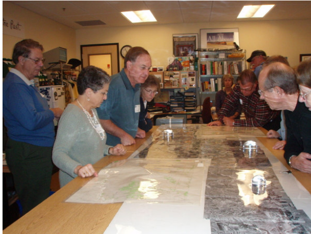
Presentation of maps and photographs