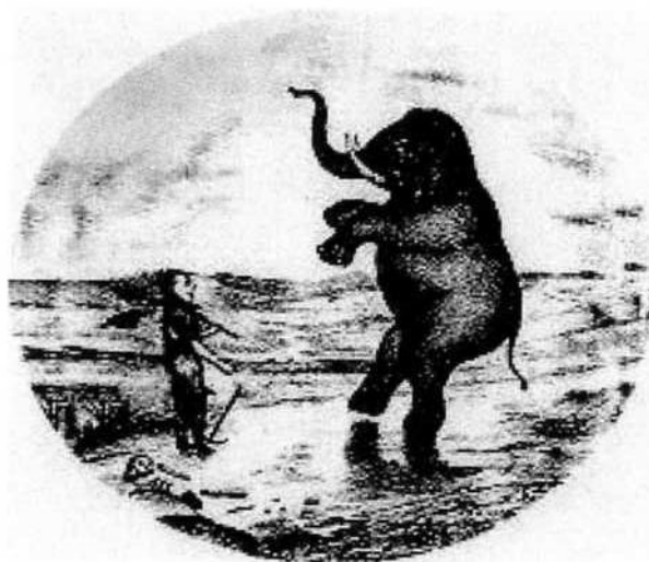
Exhibit Design Plans/copy for elephant statue

The meaning of the expression was best defined in 1844 by George Wilkins Kendall in his Narrative of the Texan Santa Fe Expedition : "When a man is disappointed in anything he undertakes, when he has seen enough, when he gets sick and tired of any job he may have set himself about, he has seen the elephant."